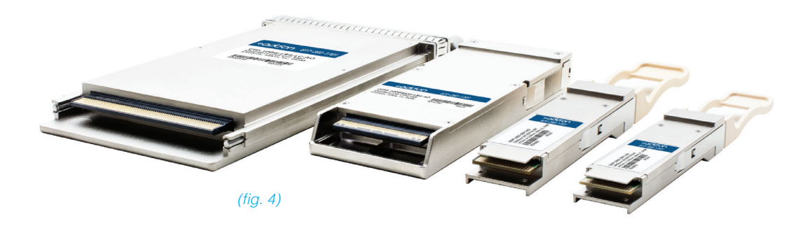
Figure 4: Network designers have a choice of transceiver form factors, including (from left) the CFP, the CFP2, the CFP4, and the QSFP28.

More recently, the MSA has delivered two additional options: the CFP4 and the CFP8. With a width of 21.5 mm, the CFP4 offers very nearly the same faceplate density as the QSFP package. It can support 4 x 10 Gbps or 4 x 25 Gbps coherent transmission. The CFP8 is roughly the same width as the CFP2 and supports 400 Gbps operation (16 x 25 Gbps or 8 x 50 Gbps). Among the key differences between the CFP2 and the CFP8 are that the CFP8 supports a higher pinout and double the power usage.