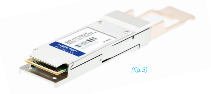
Figure 3: The QSFP28-100GB-LR4-AO is a 100 Gbps QSFP transceiver suitable for distances of up to 10 km.

The most common form factor in the intra-data center DCI space is the quad small-form-factor pluggable (QSFP) family of packaging specifications (see figure 3). QSFP interfaces support four channels operating at various speeds for aggregate data rates of 4 Gbps (QSFP, 4 x 1 Gbps), 40 Gbps (QSFP+, 4 x 10 Gbps), 200 Gbps (QSFP14, 4 x 14 Gbps), and 400 Gbps (QSFP28, 4 x 28 Gbps). In addition, work is underway on QSFP-DD, which stacks another layer of contacts on top for a total of eight lanes. This will support 200 Gbps NRZ implementations (8 x 25 Gbps) and 400 Gbps PAM-4 implementations (8 x 50 Gbps) while maintaining high faceplate densities.